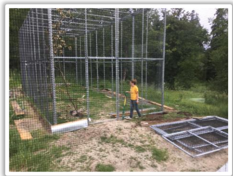
2015 volunteer Lara helping with the construction of a new enclosure.

Fill in your contact information on the form provided and we'll get in touch with you! Or you can always reach us by emailing nsobreedingprogram@gmail.com or find us on Facebook at facebook.com/nsobreedingprogram .